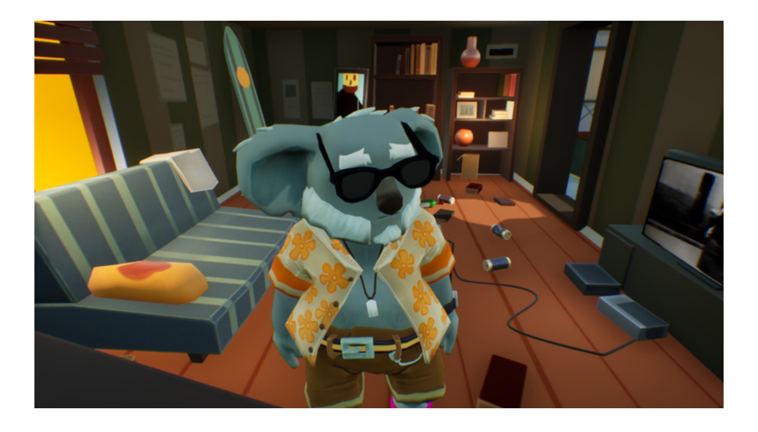
Sapper's Bad Dream Ativador Download [Xforce]

Download >>> <a href="http://bit.ly/2NRLIDE">http://bit.ly/2NRLIDE</a>